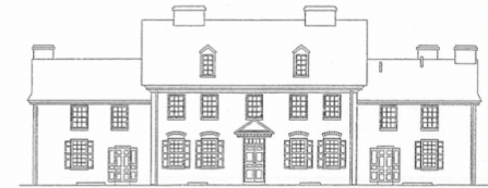
H i s t o r i c W a y n e s b o r o u g h 1 7 4 3