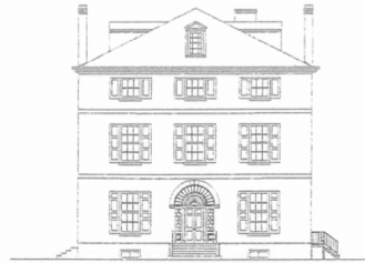
P h y s i c k H o u s e 1 7 8 6