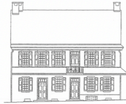
G r u m b l e t h o r p e 1 7 4 4